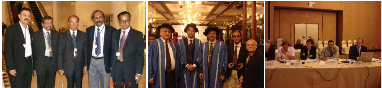
AOFG MEETING, COLOMBO