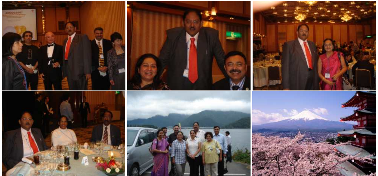
AOFG TOKYO INDIAN GROUP